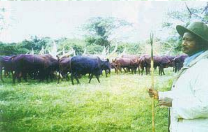
H. E Yoweri Kaguta Museveni - The President of Uganda attending to his cattle on his Ranch.

The President in his speech addressed the M.P's; to encourage persons they represent in their constituencies to engage in commercial agriculture, he cited several examples of prominent small scale farmers who have excelled in using land less than five acres to produce commercially, One prominent farmer in Mpigi district, another in Soroti on your way to Serere A.R.D.C such small plots farming is ideal for the eradication of poverty. Inclu-