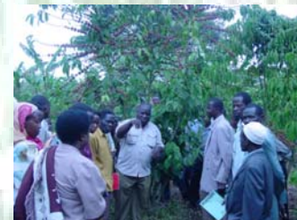
Coffee farmers undergoing a practical demonstration in the field after a training by Mr. Sentamu

The major source of information on market conditions and pricing for farmers is middlemen (traders) - not a situation that favors farmer ability to make educated selling decisions.