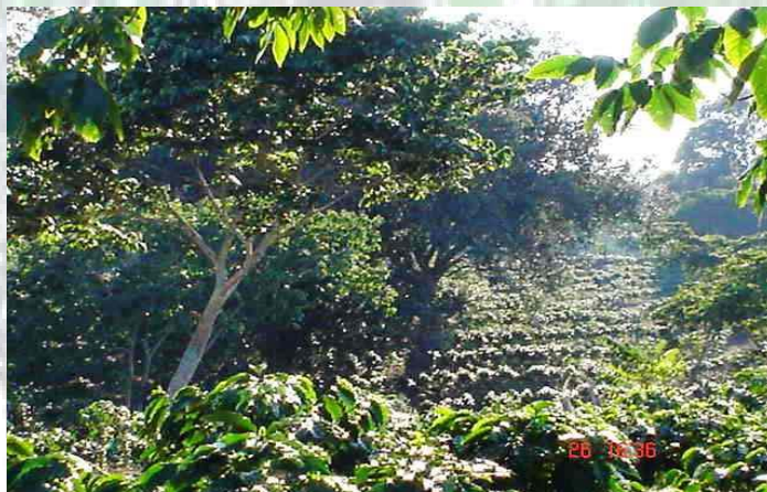
Contour planning in Finca la puebla in México (file photo)

agement are: - cost of production, role of the traders, best marketing system (Liberalized Vs controlled), farmer organization, small scale vs. Medium