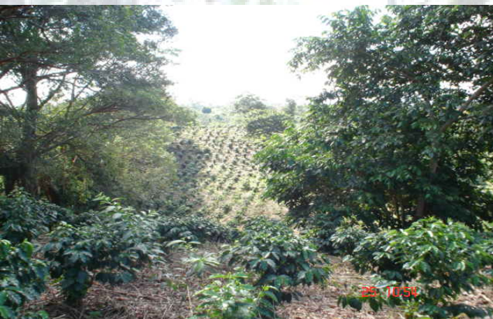
Stumped coffee trees a good coffee husbandry practice in mexico.