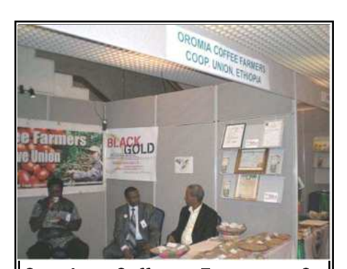
Oromia Coffee Farmers Cooperative Union, Ethiopia displaying unique Arabica coffee at the Addis Exhibition