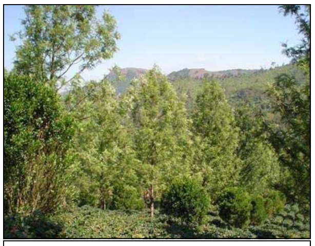
A Well maintained coffee—orange plantation, with grivellia spp. trees as shade crops. Such cropping systems are beneficial to farmers in areas where price fluctuations affect the produce.