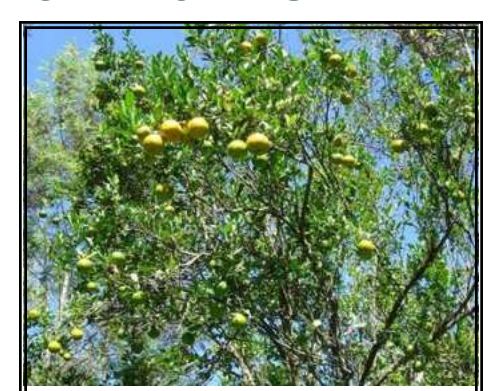
Oranges Like these Flourish Better in intercrops like coffee with good shade and better water harvesting methods

Coffee, pepper, oranges, vanilla, cardamom and arecanut grow in wild abundance. Due to the fact that coffee ecosystems comprise of various multi crops, these eco friendly coffee farms have a reputation as being polyculture in nature. The dense proliferation of trees with miles of coffee forests associated with multi-crops, play a very important positive role in shaping the coffee habitat. These multi crops not only live in close harmony with the coffee forest but are largely responsible in significantly altering the micro climate of the coffee bush. In spite of the significant reduction in coffee yields due to a number of factors like competition for nutrients, excess shade, etc, multi-crops offers distinct advantages in enhancing the intrinsic value of Indian coffee by giving it a unique taste of "nature "in the cup.