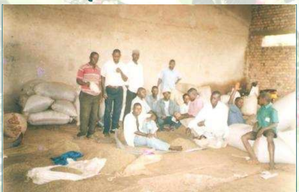
After collecting their coffee, farmers from Buwama Coffee Farmers Association in Mpigi district gladly sort their coffee after hulling., removing all black beans. Value addition of coffee is key, for farmers to earn better from their produce