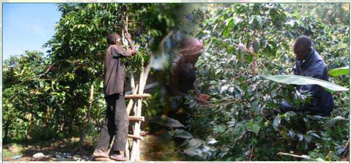
An elderly farmer climbs a ladder to harvest his coffee, such coffee trees are targeted by the coffee production campaign, on the right a couple harvests a well managed coffee bush, such bushes are high yielding, ease to harvest