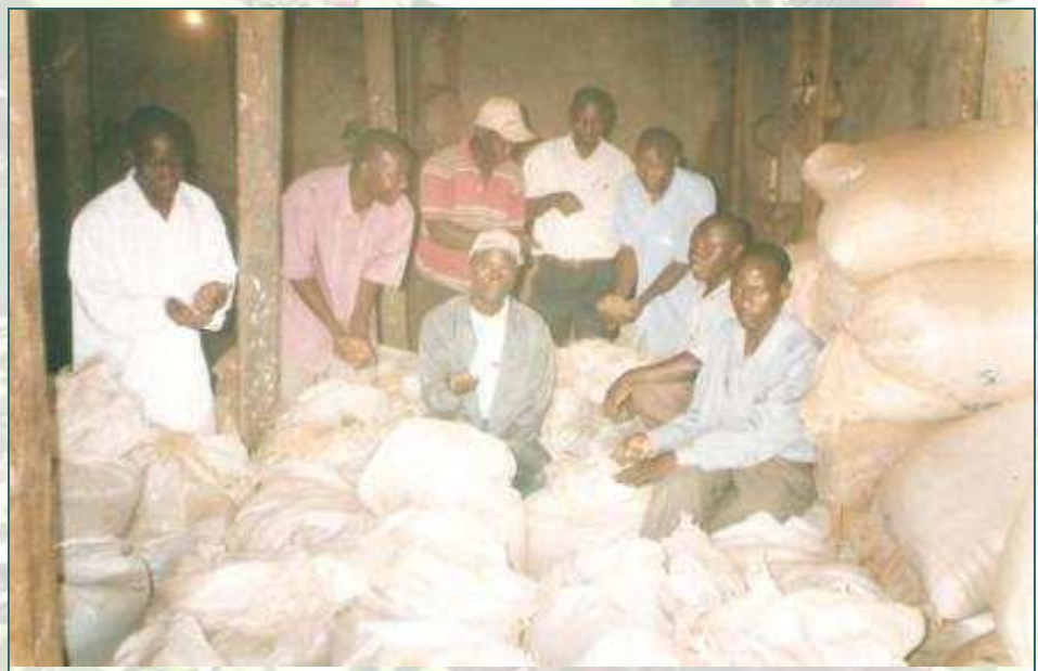
After collecting their coffee, farmers from Buwama Coffee Farmers Association in Mpigi district gladly display their coffee after hulling. Value addition of coffee is key, for farmers to earn better from their produce

The Robusta crop has just concluded from the south and south western Uganda in August marketing of the mainly Arabica Crop from eastern and North western Uganda (west Nile) started in October at the beginning of this quarter. Despite the lack of funds, efforts were made for better prices for the best quality produced by farmers through meetings with kyagalanyi coffee exporters Ltd, Head office and there respective buying center managers in paidha and mbale districts. A fair price of Ushs 2900 per kilo of premium coffee for NUCAFE groups in west Nile was given with a promise of an additional 200shs after the sale of coffee by kyagalanyi for each kilo of premium quality. In the eastern Uganda the negotiations resulted into a price of Ushs 3000 per kilo of premium coffee for NUCAFE groups with a promise of an additional 200shs after the sale of coffee by kyagalanyi for each kilo of premium quality. Some of the farmers have been able to obtain this price whereas others have failed mainly because of lack of access