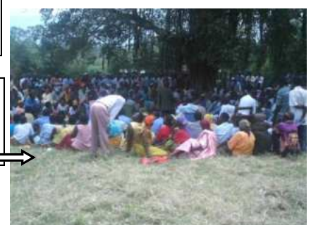
THE DISTRICT NAADS COORDINATOR OF KANUNGU ADDRESSING FARMERS OF THE PARTNERSHIP BETWEEN NUCAFE AND NAADS