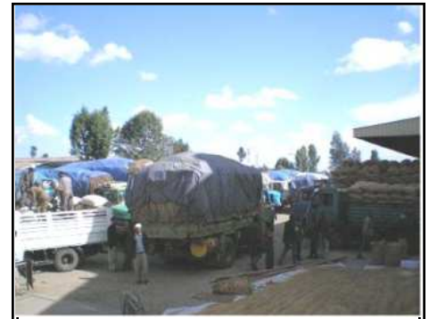
Trucks loaded with Arabica parchment coffee at the Addis Ababa Coffee Auction ready for quality analysis and grading

What is apparent is that co-operative societies are still playing a pivotal role in mobilising and marketing of coffee in Ethiopia. The coffee is then auctioned in Addis Ababa in the Central Auction after rigorous quality analysis has been done. This involvement was also manifested in