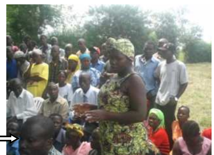
SOME OF THE WOMEN ADDRESSING ISSUES THAT AFFECT THEM IN COCOA FARMING, LIKE MANY AGRO-ENTERPRISES, LABOR ON FARMS ITS MARJORY WOMEN WHO PERFORM MOST TASKS