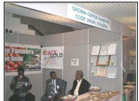
Oromia Coffee Farmers Co-operative Union, Ethiopia displaying unique Arabica coffee at the Addis Exhibition