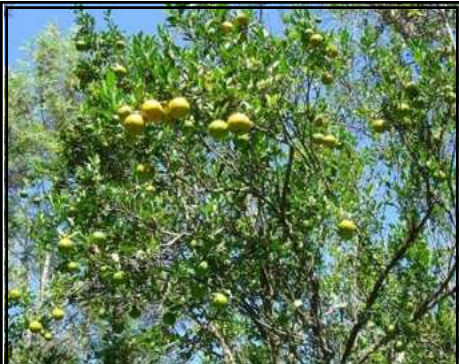
Oranges Like these Flourish Better in intercrops like coffee with good shade and better water harvesting methods

Coffee, pepper, oranges, vanilla, cardamom and arecanut grow in wild abundance. Due to the fact that coffee ecosystems comprise of various multi crops, these eco friendly coffee farms have a reputation as being polyculture in nature. The dense proliferation of trees with miles of coffee forests associated with multi-crops, play a very important positive role in shaping the coffee habitat. These multi crops not only live in close harmony with the coffee forest but are largely responsible in significantly altering the micro climate of the coffee bush. In spite of the significant reduction in coffee yields due to a number of factors like competition for nutrients, excess shade, etc, multi-crops offers distinct advantages in enhancing the intrinsic value of Indian coffee by giving it a unique taste of "nature "in the cup.