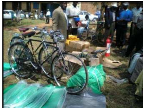
THE CHAIRMAN KIBINGE C.F.A HANDING OVER BICYCLES AND TARPULINS TO FARMERS PAVING WAY TOWARDS GETTING FARMERS UTZ KAPEH CERTIFIED.

It was not long when I received an invite to attend a colorful event that was to be organized in Masaka - Kibinge Sub County. Long before I'd heard about Kibinge Coffee Farmers Association and all the fame that came with the name, it was a whole package. Mentioning the name meant nothing else to the listener other than coffee farmers smiling all the way to the bank, healthy households and good green well maintained coffee plantations. At the beginning of the year 2006, Kibinge was hitting the skies it got a grant for Utz Kapeh certification, it was one of these events that are involved in the certification programme that got me an all expenses paid ticket to the one place I had always yearned to be.