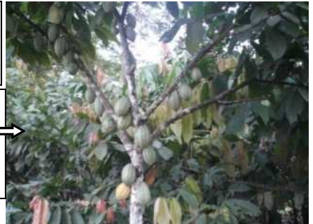
A COCOA TREE IN FULL FRUIT, SUCH TREES ARE IN ABUNDANT DESPITE THE POOR AGRICULTURAL PRACTICES. WITH TRAINING OFFERED FROM NUCAFE, YIELD FROM SUCH TREES IS EXPECTED TO INCREASE