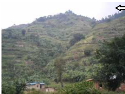
BEAUTIFUL LANDSCAPE OF THE WESTERN REGION THAT FAVOR COCOA AND COFFEE GROWING THUS MAIN INCOME EARNER IN BUNDIBUGYO