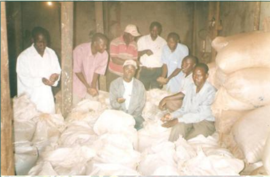
After collecting their coffee, farmers from Buwama Coffee Farmers Association in Mpigi district gladly display their coffee after hulling. Value addition of coffee is key, for farmers to earn better from their produce

The Robusta crop has just concluded from the south and south western Uganda in August marketing of the mainly Arabica Crop from eastern and North western Uganda (west Nile) started in October at the beginning of this quarter. Despite the lack of funds, efforts were made for better prices for the best quality produced by farmers through meetings with kyagalanyi coffee exporters Ltd, Head office and there respective buying center managers in paidha and mbale districts. A fair price of Ushs 2900 per kilo of premium coffee for NUCAFE groups in west Nile was given with a promise of an additional 200shs after the sale of coffee by kyagalanyi for each kilo of premium quality. In the eastern Uganda the negotiations resulted into a price of Ushs 3000 per kilo of premium coffee for NUCAFE groups with a promise of an additional 200shs after the sale of coffee by kyagalanyi for each kilo of premium quality. Some of the farmers have been able to obtain this price whereas others have failed mainly because of lack of access