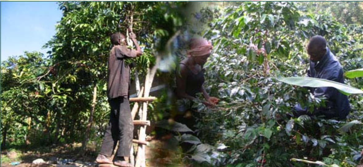
An elderly farmer climbs a ladder to harvest his coffee, such coffee trees are targeted by the coffee production campaign, on the right a couple harvests a well managed coffee bush, such bushes are high yielding, ease to harvest

During the month of October coffee prices recorded a further increase, with the ICO composite indicator price at 115.71 US cents/lb. Market fundamentals remain favourable to the continuation of this firm price trend. October was also marked by the beginning of the crop year in many exporting countries. Adverse weather conditions have continued to affect most of these countries, particularly in Mex-