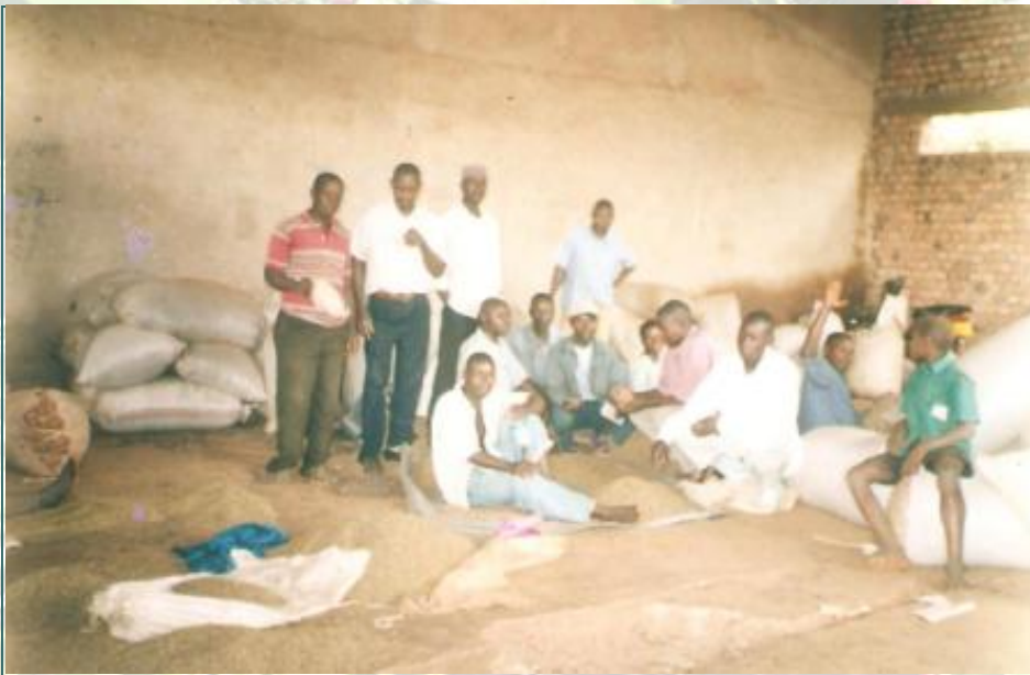
After collecting their coffee, farmers from Buwama Coffee Farmers Association in Mpigi district gladly sort their coffee after hulling., removing all black beans. Value addition of coffee is key, for farmers to earn better from their produce